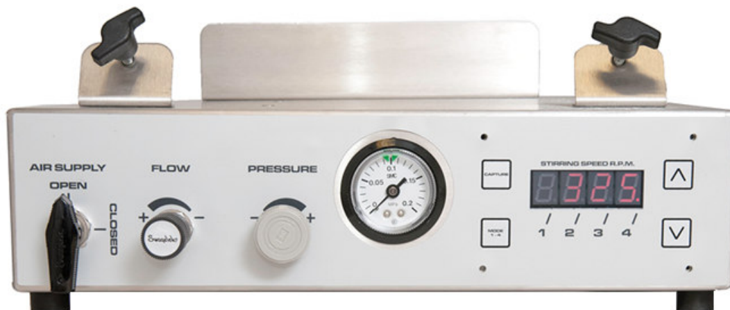
Figure 3 The ATLAS™ Pneumatic Control Box with Sample Stirrer Module upgrade

During standard operation, clean, dry compressed air (see “Lonestar and ATLAS Technical Specifications”) is connected to the ATLAS™ Pneumatic Control Box where the source air pressure is regulated. The compressed air then enters the hydrocarbon scrubber on the right hand side of the Lonestar® and is connected to the ATLAS™ Sampling Module Assembly via the clean gas outlet on the left hand side of the Lonestar®. The sample and makeup air then exit the Lonestar® system via the exhaust. If a split or makeup flow is required, these flows are controlled by the use of either rotameters or orifices; see “The Installation of a Lonestar ATLAS System” for more information.