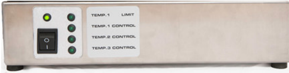
Figure 4 The ATLAS™ Heater Control Box

The ATLAS™ Heater Control Box controls the temperatures within the ATLAS™ Sampling Module Assembly. This has three heated zones, the Sample Holder, the Sample Lid and the Filter Block. The temperature setpoints for each of these regions is held within the method configuration, and are specific for each different chemical analysis method.