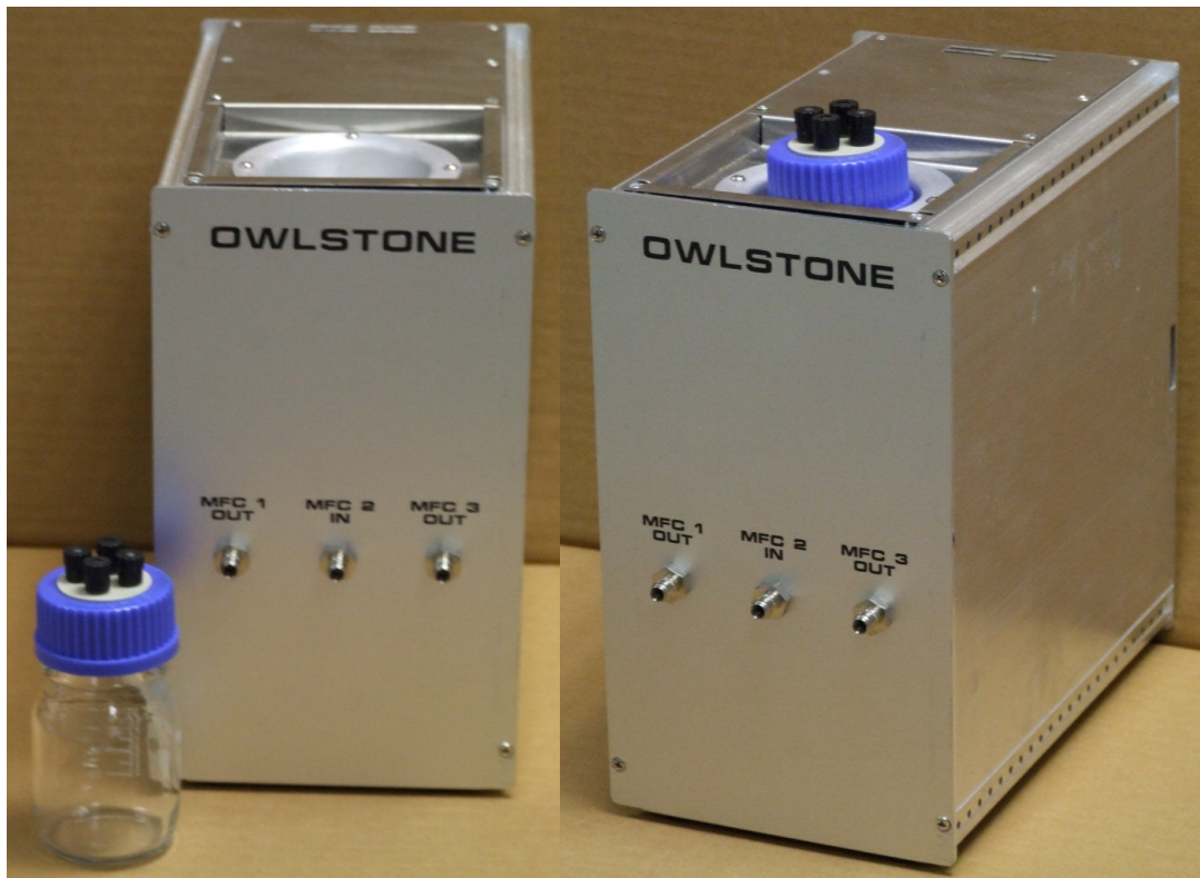
Figure 5 Split Flow Boxes showing the positioning of the bottle used for humidifying the sample flow or the makeup flow

The Split Flow Box houses three mass flow controllers that the Lonestar® software is able to communicate with to control the flows through the ATLAS Sampling module throughout the sample analysis and venting procedure.