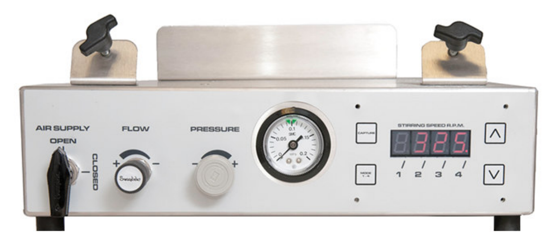
Figure 3 The ATLAS™ Pneumatic Control Box with Sample Stirrer Module upgrade

During standard operation, clean, dry compressed air (see "Lonestar and ATLAS Technical Specifications") is connected to the ATLAS™ Pneumatic Control Box where the source air pressure is regulated. The compressed air then enters the hydrocarbon scrubber on the right hand side of the Lonestar® and is connected to the ATLAS™ Sampling Module Assembly via the clean gas outlet on the left hand side of the Lonestar®. The sample and makeup air then exit the Lonestar® system via the exhaust. If a split or makeup flow is required, these flows are controlled by the use of either rotameters or orifices; see "The Installation of a Lonestar ATLAS System" for more information.