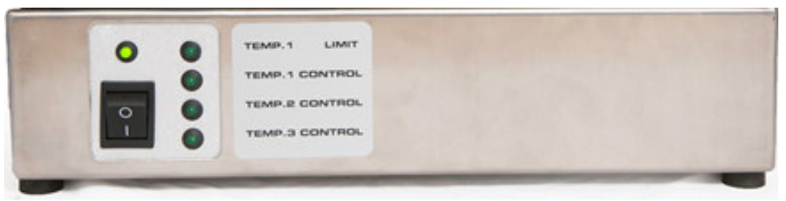
Figure 4 The ATLAS™ Heater Control Box

The ATLAS™ Heater Control Box controls the temperatures within the ATLAS™ Sampling Module Assembly. This has three heated zones, the Sample Holder, the Sample Lid and the Filter Block. The temperature setpoints for each of these regions is held within the method configuration, and are specific for each different chemical analysis method.