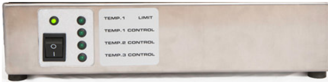
Figure 4 The ATLAS™ Heater Control Box

The ATLAS™ Heater Control Box controls the temperatures within the ATLAS™ Sampling Module Assembly. This has three heated zones, the Sample Holder, the Sample Lid and the Filter Block. The temperature setpoints for each of these regions is held within the method configuration, and are specific for each different chemical analysis method.