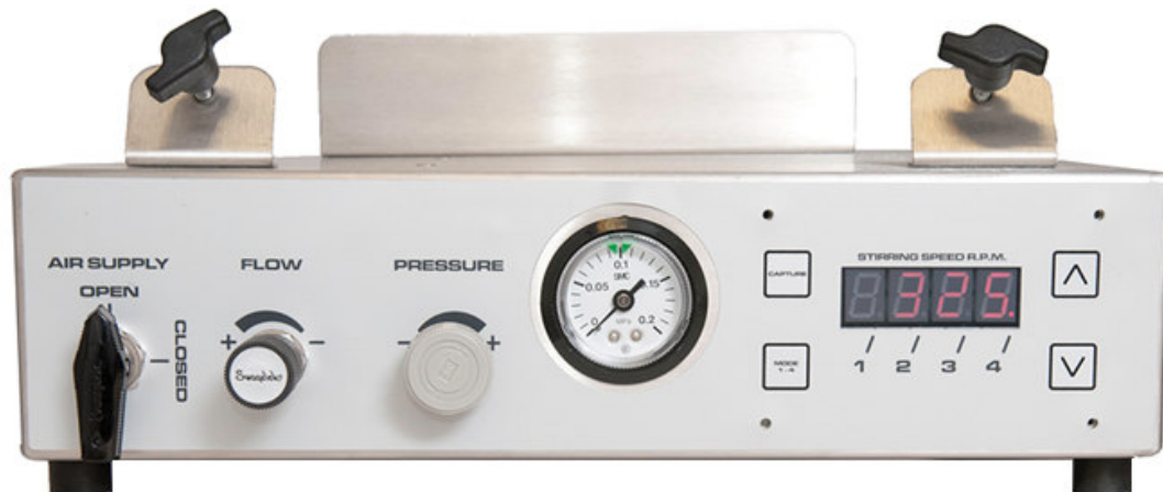
Figure 3 The ATLAS™ Pneumatic Control Box with Sample Stirrer Module upgrade

During standard operation, clean, dry compressed air (see “Lonestar and ATLAS Technical Specifications”) is connected to the ATLAS™ Pneumatic Control Box where the source air pressure is regulated. The compressed air then enters the hydrocarbon scrubber on the right hand side of the Lonestar® and is connected to the ATLAS™ Sampling Module Assembly via the clean gas outlet on the left hand side of the Lonestar®. The sample and makeup air then exit the Lonestar® system via the exhaust. If a split or makeup flow is required, these flows are controlled by the use of either rotameters or orifices; see “The Installation of a Lonestar ATLAS System” for more information.